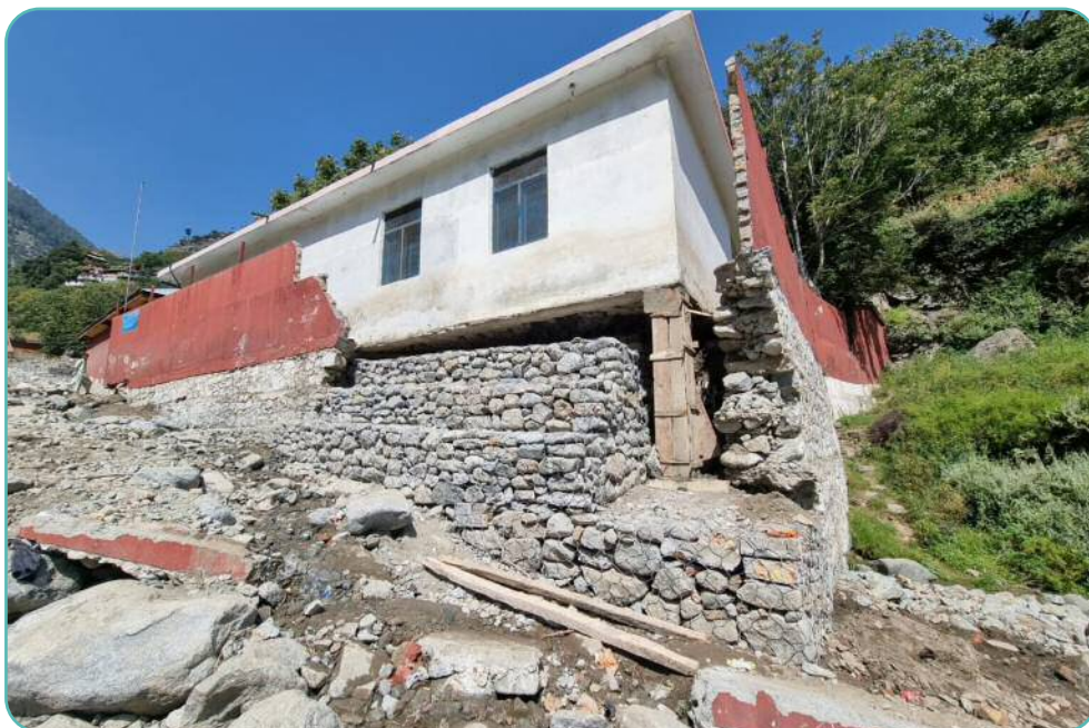
Fig. 07: Torwal school in the Swat Valley, Pakistan. Rehabilitation works with gabion walls. Christian Neuhaus, SDC 2022.